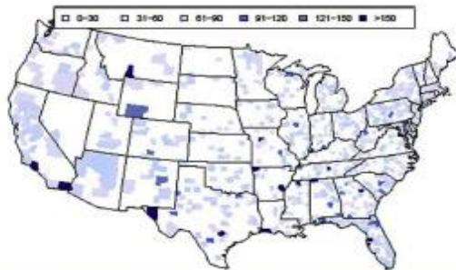
Fig 1. Intensity map demonstrating variation in median annual endovenous therapy (EVT) services per provider by county.

Conclusions: There is great variation in intensity of vein ablation procedures performed on Medicare beneficiaries that cannot readily be explained by clinical factors alone. The likelihood that a provider will