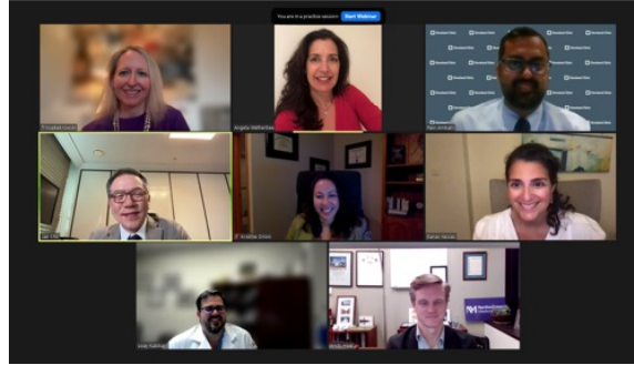
Screenshot from the October 2023 Webinar Sponsored by Terumo Aortic

For information regarding the Society go to our website: https://www.midwestvascular.org